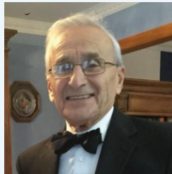
Co-Founder of Long Island Rachel Vineyard Weekend Retreats Initiated the Baby Bottle Campaigns for the Life Center of LI