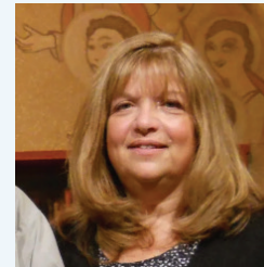
Author, Co-Developer, and Speaker on Post-Abortion Healing