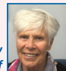
Meg Malley Hempstead Staff

*Names have been changed to protect confidentiality