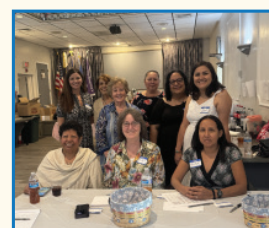
Life Center Staff and CEO

The Life Center of Long Island recently hosted their volunteer appreciation luncheon to acknowledge all of our wonderful volunteers who share their wonderful gifts and talents and give so much of themselves to our mission in defending the rights of the preborn. Their unwavering commitment is invaluable to our ministry. We are truly blessed to have them! Please join us in congratulating the recipients of our prestigious 2025 Life Center Gospel of Life Award at the Life Center's Volunteer Luncheon.