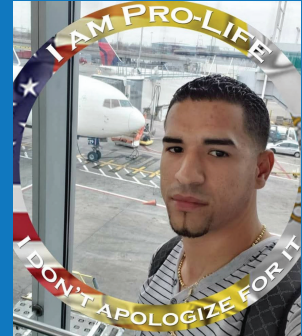
Pro-Life Warrior Pardoned by President Trump

A GREAT WAY TO SUPPORT OUR WORKS IS TO PLACE AN AD IN OUR JOURNAL (This journal will be taken home by our attendees; it is a great way to advertise your business.)