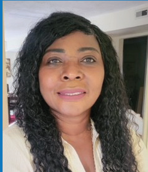
CEO, Founder Precious Life Center of Ghana