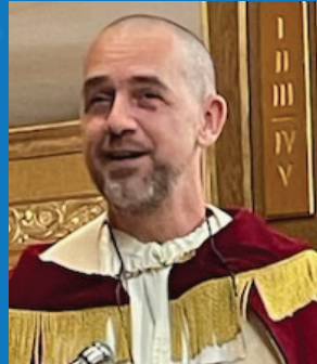
Franciscan Friar of the Renewal Pardoned by President Trump