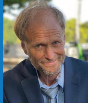
Pro-Life Warrior Pardoned by President Trump